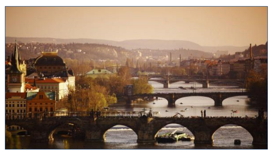
The event was held in the beautiful city of Prague

Prague, Czech Republic, 9-10 October 2014